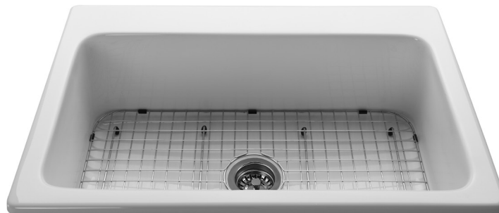
Optional sink grid shown above.

Measurements are \pm 1/2 " and are subject to change without notice. Data herein supersedes all previous prior to publication date indicated below.