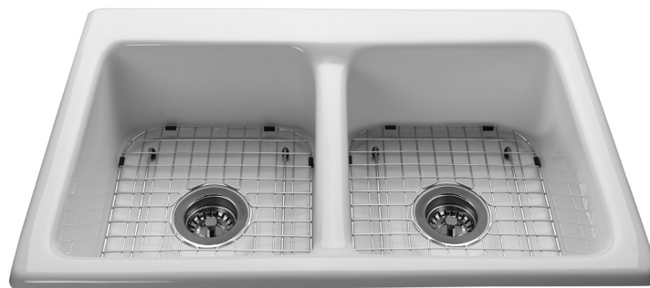
Optional sink grids shown above.

Measurements are ±1/2" and are subject to change without notice. Data herein supersedes all previous prior to publication date indicated below.