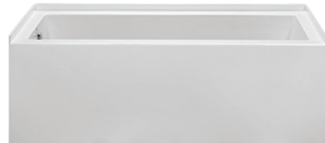
Front view of the integral skirt.