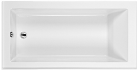
Features integral front skirting & integral tile flange on 3 sides.