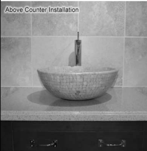
Above Counter Installation

There are two different ways to mount a vessel sink.