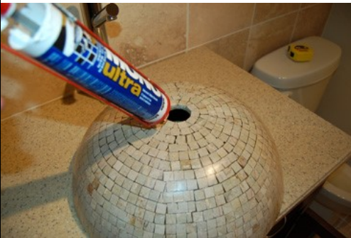
Above: Above Counter Vs. Recessed Installation

* Occasionally plumbers putty or silicone may be required between the drain and sink to ensure a leak proof seal. Test this by running the water and evaluating.