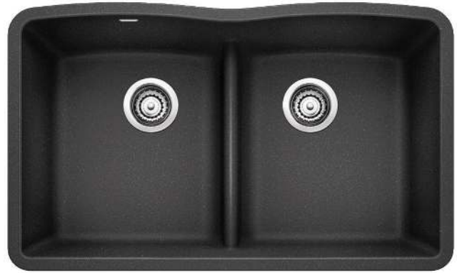
Model 442075 shown