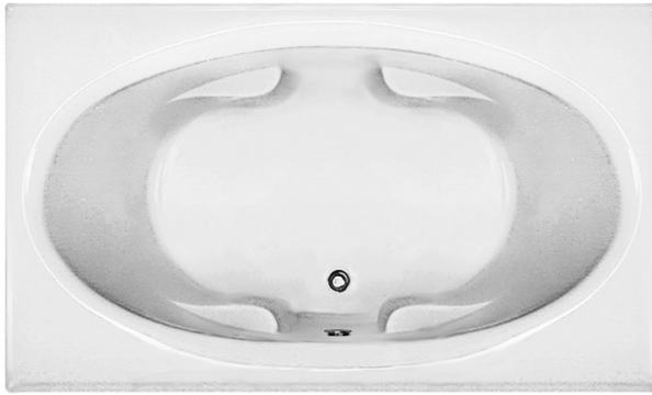
Features integral armrests.