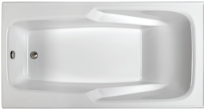
Features integral armrests.