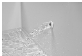
Virtual Spout integrated high-flow tub filler. See 'packages and options' below.