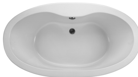
inside view of tub

NOTE: Filling this tub to the maximum may require an above average size or dedicated water heater.