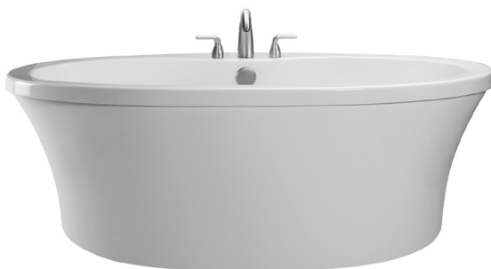
Shown with a deck-mounted faucet. Faucet is not included with tub.