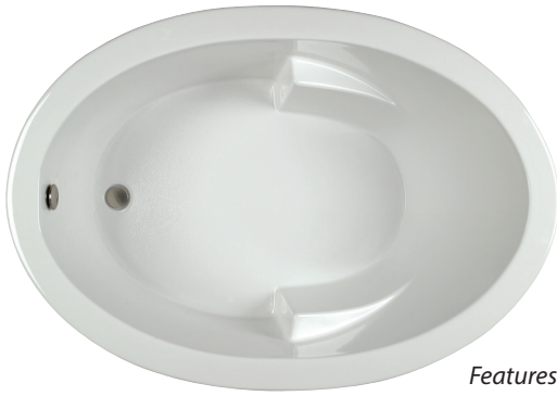
Features integral armrests.