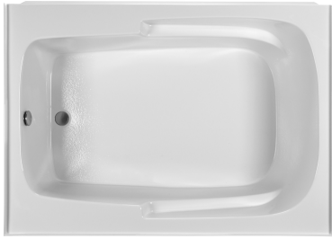
Features integral front skirting, armrests & factory installed tile flange on 3 sides.