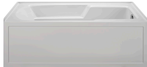
Front view of the integral skirt.