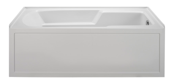
Front view of the integral skirt.