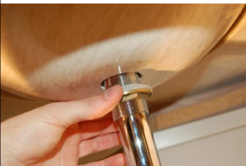
Above: Drain Attachment

There are two different ways to mount a vessel sink.