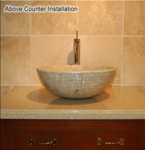
Above Counter Installation