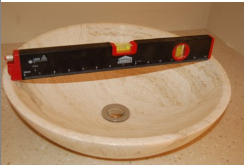
Above: Process for "Recessed Mounting"