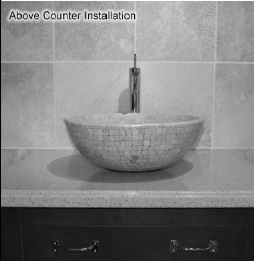
Above Counter Installation

There are two different ways to mount a vessel sink.